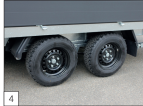
Standard: with tyres 185/70 R 13C with black rims.