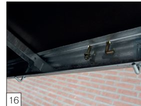
Option: boltable rope hooks mounted underneath the sides edges.