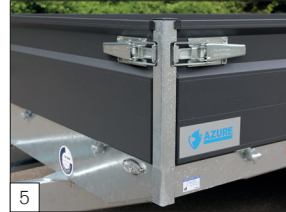
Standard: aluminium dropsides 40 cm high with a coating in anthracite.