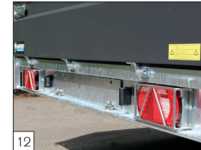
Standard: LED rear lights at the back.