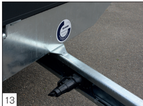
Standard: resistance unit for the LED-lighting.