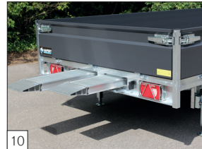
Standard: aluminium reinforced loading skids 250 cm integrated.