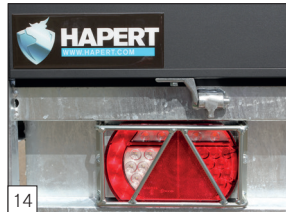
Standard: rear light protection.