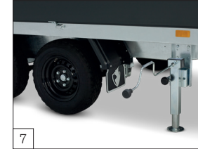
Standard: 90° swivelling heavy duty prop stands incl. support crank not mounted.