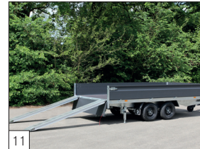
Standard: 'DRIVE-ON'- kit mounted (aluminium loading skids and prop stands).