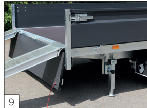
Standard: U-profile at the rear to put on the loading skids.