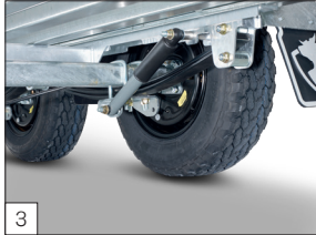
Standard: parabolic leaf spring axles incl. shock absorbers.