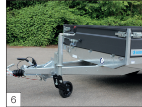
Standard: an extra reinforced jockey wheel.