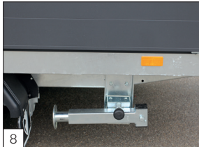
Standard: the prop stands are adjustable and 90° swivelling.