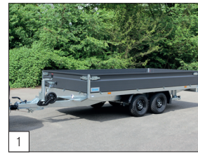
Standard: interior dimension 400 x 200 x 40 cm.