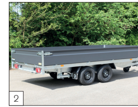
Standard: Maximum Gross Weight 3500 kg.